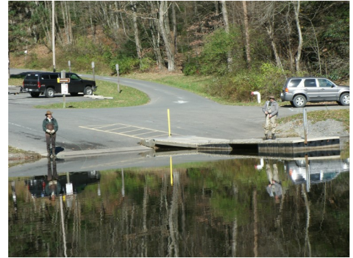
Lake Day at Tuscarora SP

300 W. State Street , Media, PA 19063, (610) 565-