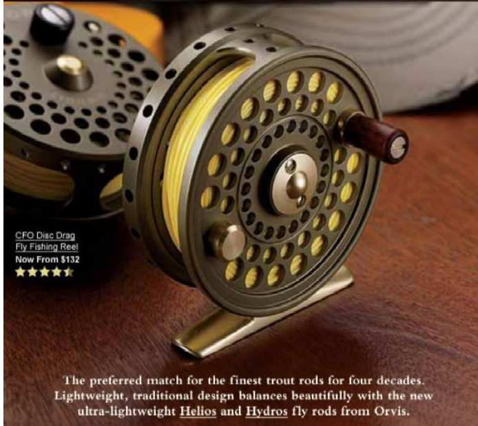
CFO Disc Drag Fly Fishing Reel Now From $132 ★★★★★

ON THE LEGENDARY CFO TROUT REEL IN THE MONTH OF JANUARY.