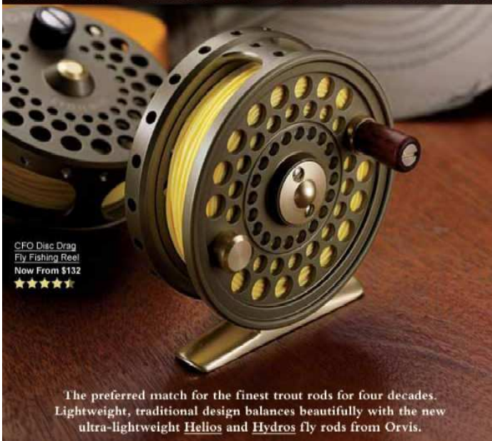
CFO Disc Drag Fly Fishing Reel Now From $132 ★★★★★

ON THE LEGENDARY CFO TROUT REEL IN THE MONTH OF JANUARY.