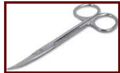
A typical pair of Iris scissors

your scissors to cut some of the nymph wing cases. Wing burners are often used but if you prefer to hand cut your wing cases the curved scissors will help you get a more natural shape. ✂