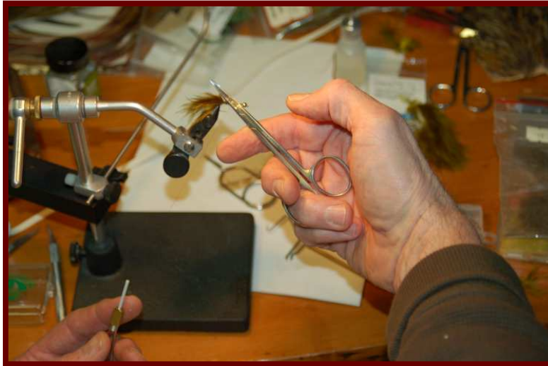
Here the scissor-tip is used to control the location of a simple half-hitch knot

If you not so concerned with speed it still makes sense to carry your scissors in you hand to simplify your methodology and have them