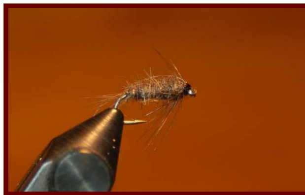
Early nymphs resembled wets without wings- (Maybe the lack of good head cement was to blame)

usually try to do is to take it all in . It seems that a lot of folks