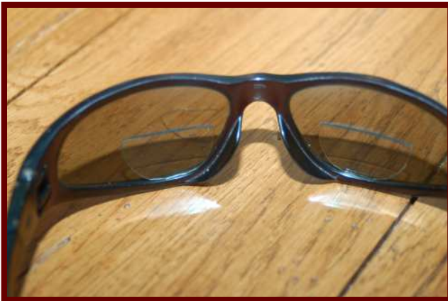
These "suction on" magnifiers convert your existing sunglasses into bifocals. You can even trim them to fit!

now that I've used these neat little flexible magnifiers that make bifocals out of existing sunglasses. These are a blessing to the guys that need a prescription for distance and need some help during the knot-tying phase of their day a field. They use no adhesive and are applied wet to the inside of your glasses. By squeezing out the air and water with a dry paper towel they suction to the glasses for many days. It's good to clean and reapply them every now and then—just to make sure they stay in place. 🪰