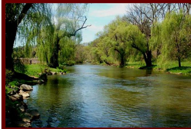
Special Regulations section of the Little Lehigh Creek

a movie costs about $6.66 per hour, even without the popcorn. At that rate, you only have to fish 4.8